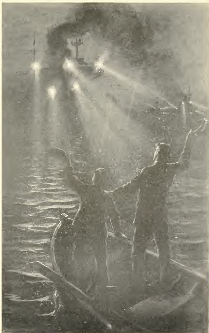
IN THE BLINDING GLARE OF THE SEARCH-LIGHT